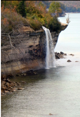
Fall into Recovery

A Peer Support Specialist is a person who was, or is currently a consumer of Mental Health services. A Peer Support Specialist has experienced first hand how mental illness can affect your life. They have a unique background and skill level from their